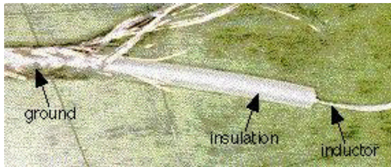
Figure: A coax cable

Consider a length of coaxial cable that connects your Cable TV port to your TV input. This cable, and other similar things such as your data transmission line, can all be modeled as a bunch of inductors, resistors and capacitors in an arrangement that we shall call by the generic term: transmission line .